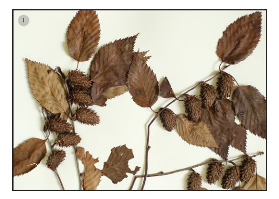
Fig. 1. Common view of fruit catkins of Betula grossa.