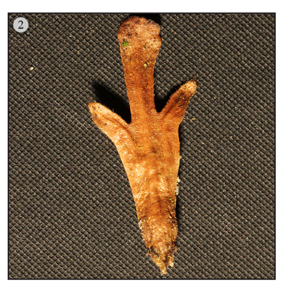
Fig. 2. The scale of Betula medwediewii .

According to our results, the morphogenetic type of fruit type of the genus Betula section Lentae is the pyrenarium of the Olea -type (BOBROV et al. 2009). This is an indehiscent