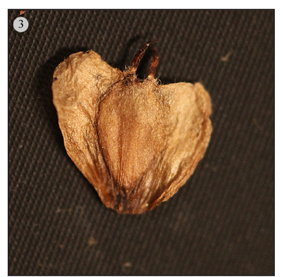
Fig. 3. The fruit of Betula alleghaniensis.